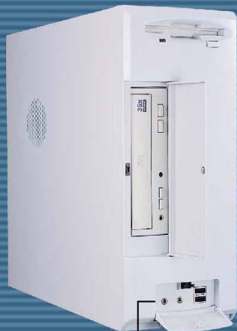
Front access USB/Audio module

200W PS'U with ATX 12V, even PFC (250W coming soon)